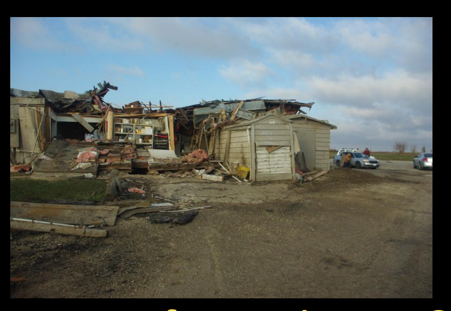
Where do you go from here?