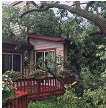
Village of Grant Park