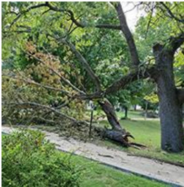
City of Spring Valley