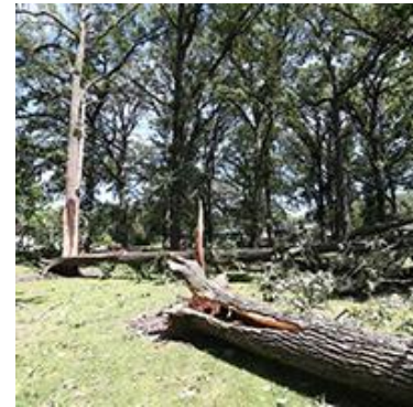
City of Oglesby